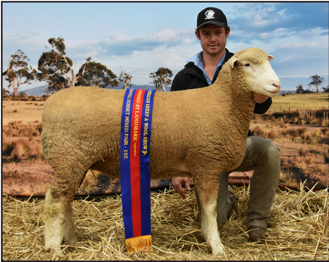
Ewe 160-16 Supreme Short Wool Ewe at Canberra Reserve Champion Ewe at Sydney Champion Mixed Pair Bendigo