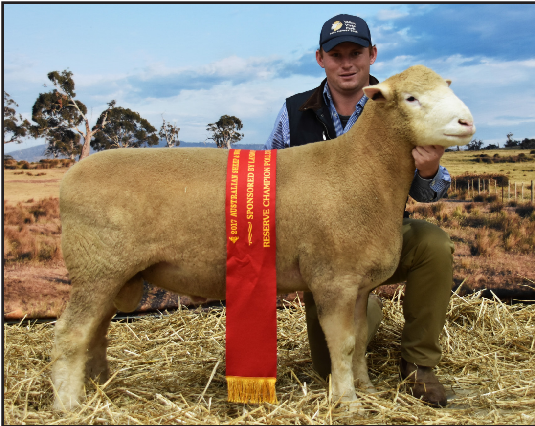
Ram 69 -16 Reserve Champion Ram at Bendigo Retained in Stud - Semen available